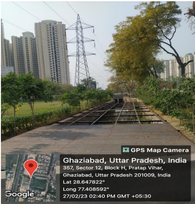
Maintenance of Water Bodies